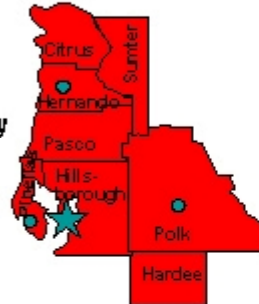
Tampa Bay Region

Alachua County Baker County Bradford County Clay County Duval County Flagler County Gilchrist County Levy County Marion County Nassau County Putnam County St. John's County Union County